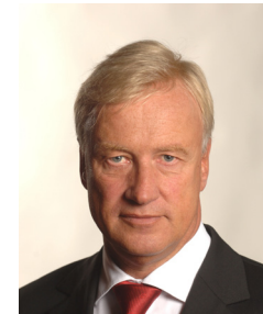
Ole von Beust, First Mayor of Hamburg, Patron of the 4th German-Arab Health Forum