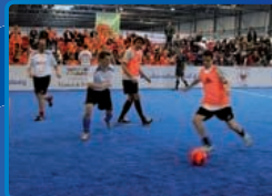
CHARITIES & EVENTS

SPORTAINMENT GROUP GMBH • INFANTERIESTR. 19 / HAUS 5 • 80797 MÜNCHEN • GERMANY