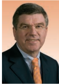
Dr. Thomas Bach