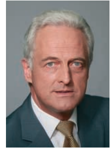
Dr. Peter Ramsauer

The Arab world is undergoing a radical change. Together with its partners in Europe and in the world Germany is promoting all efforts to make this a peaceful process. The decisive factor hereby is that we continue our positive economic cooperation. The German industry and especially the construction industry can make a concrete contribution to a positive restart.