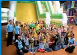
KIDS SPORTS WORLD